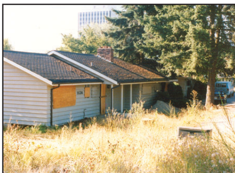
The humble beginnings: The two lots as Rosalie purchased them in 1990 – the Museum site.

Currently under construction is a retail and residential high-rise that will border the planned Ashwood Park Plaza, the gateway into Ashwood Park, which is also adjacent to the Museum. The tower will include a 200-