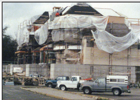
1992 Roofing the Museum in the Northwest rain.

Meanwhile, we are once again busy planning a grand 15 th Anniversary celebration and we hope YOU, our dear member, supporter, docent, or visitor will come and celebrate with us on