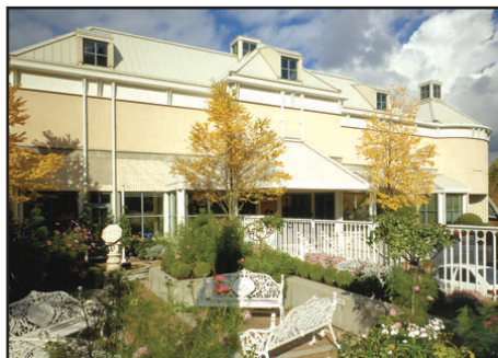
The Museum as it opened September 16, 1992.

SATURDAY, SEPTEMBER 15 and throughout the following week.